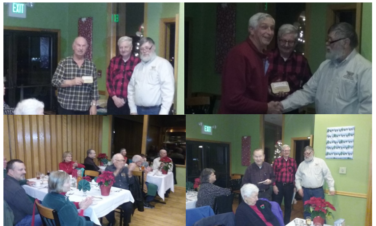
Year end party at the CPO Club, Prizes and Awards plus good food